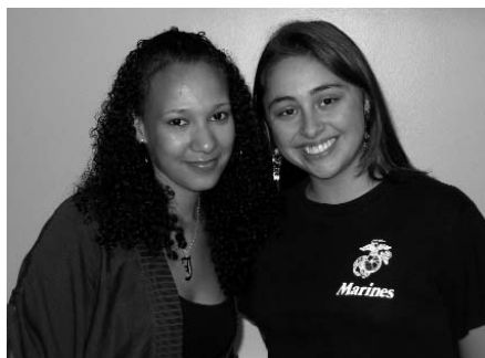
Bronx Science student leaders, 2006-07.