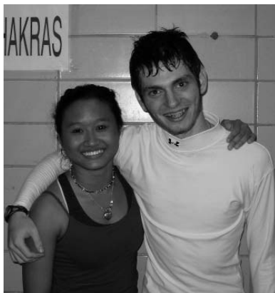
2006 Heisman award nominees.